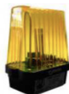
LED flashing light